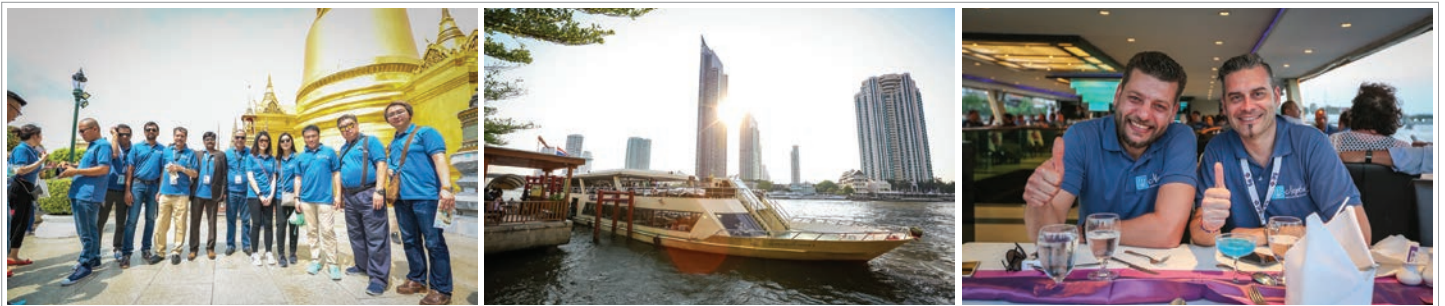
Photo 1: Some delegates had their group picture around the Grand Place Temple.

The third day of the conference was nice and casual as we explored the city of Bangkok in the morning where we visited the Grand Palace. During this time the security at the temple was more heightened after the recent death of the Thailand's King, as many locals and tourists visited to pay their respects.